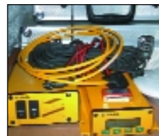
RTK Sat. Nav.